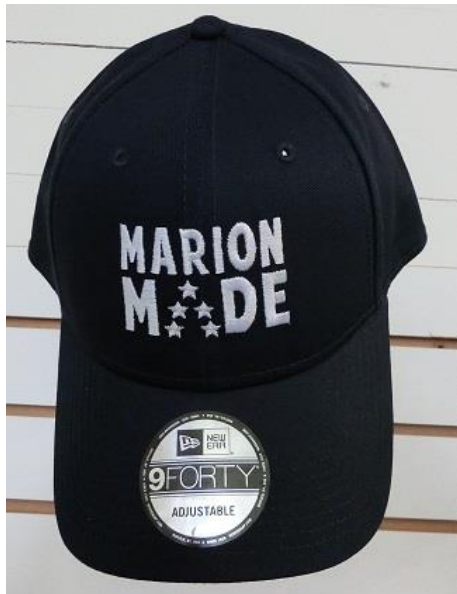
Marion Made Adjustable Structured Cap