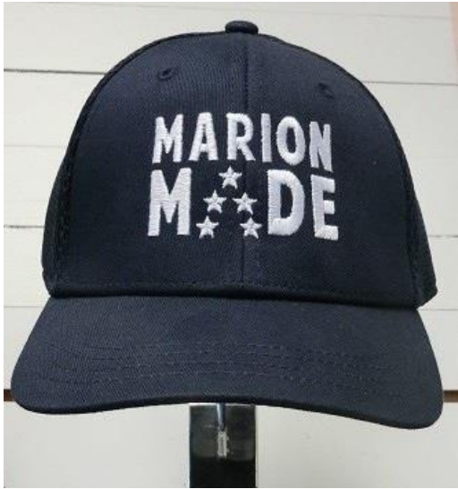
Toddler/Youth size Marion Made 39Thirty Cap

100% Cotton front panels & visor 100% Polyester mid and rear panels One size fits most