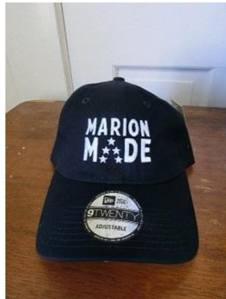
Marion Made Adjustable Unstructured Cap