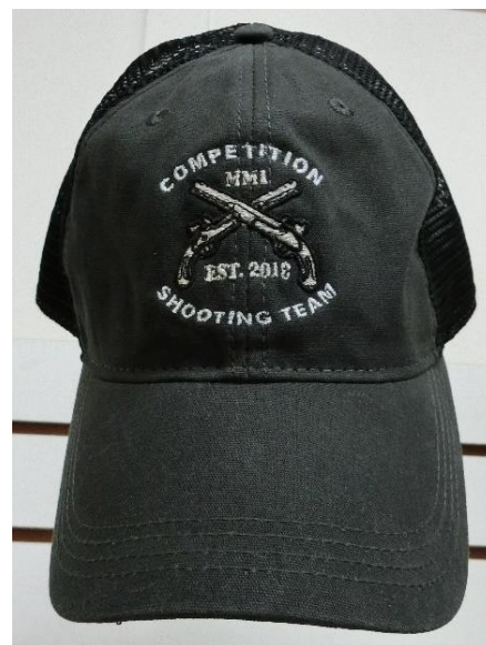
Competition Shooting Team Cap