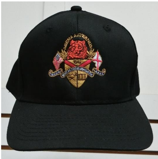
Alumni Brigade Cap