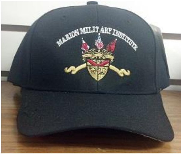
Crest Adjustable Black Cap